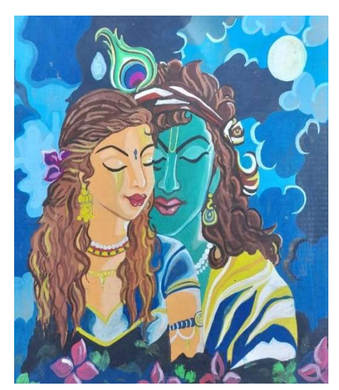
Painting by Navmeet