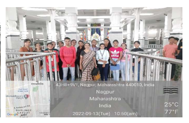
Visit of Statistics students.