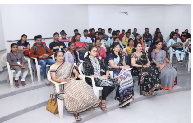
Audience engrossed in lecture