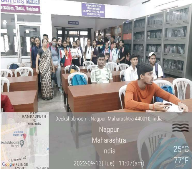
Inside view of Reading Room of Library